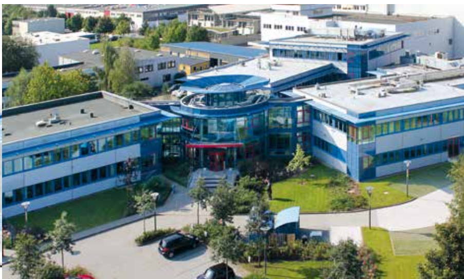
The Technology Centre in Ahrensburg near Hamburg